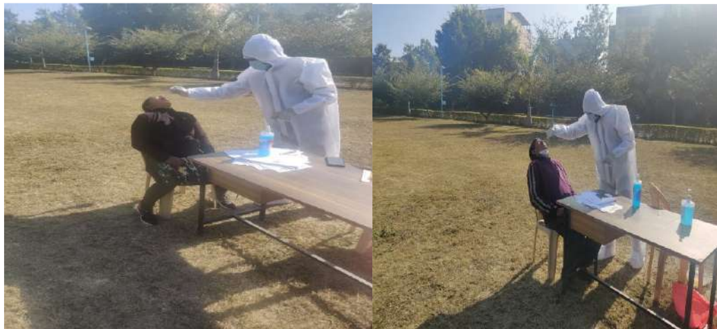
COVID Test in Progress

Altogether, 239 students out of 243 have returned to school. The remaining 4 girls, who are from Sikkim, will be returning soon. 35 students of Class V are continuing their classes from home.