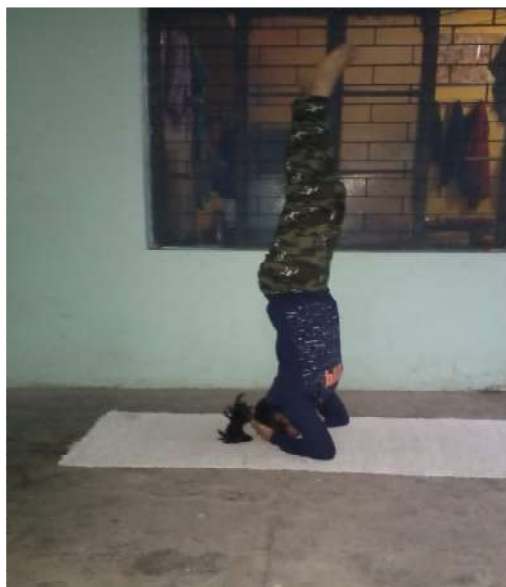
Girls performing various Asanas