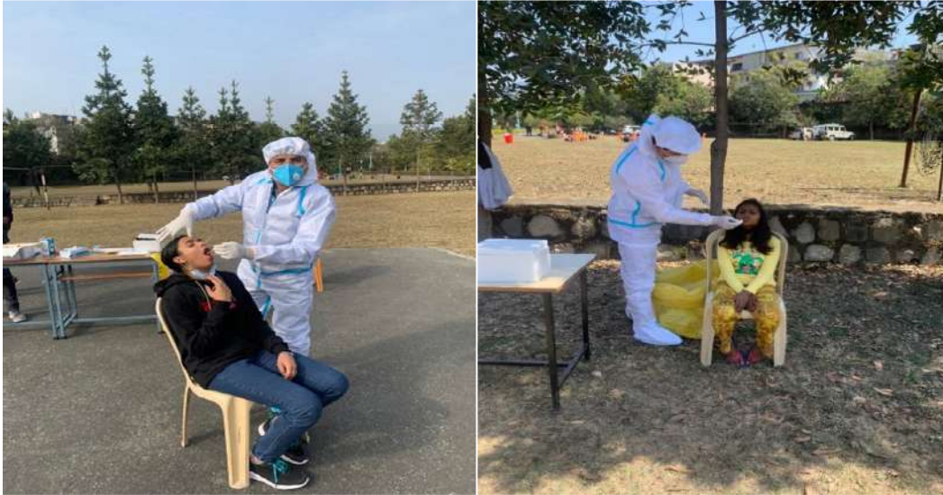
Medical Camp for Students