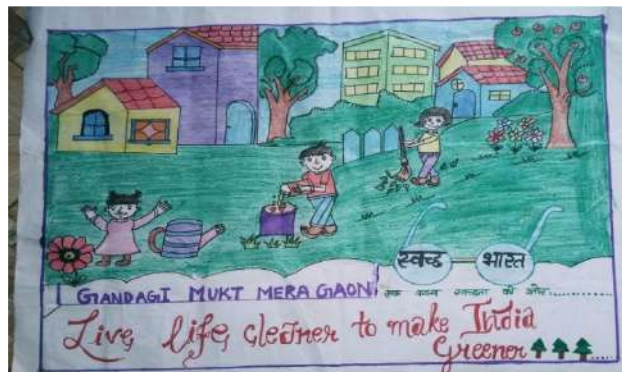
Nidhi Tangariya – VII